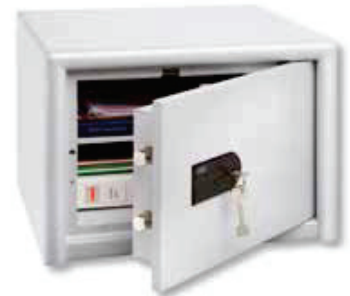
CL 20 S