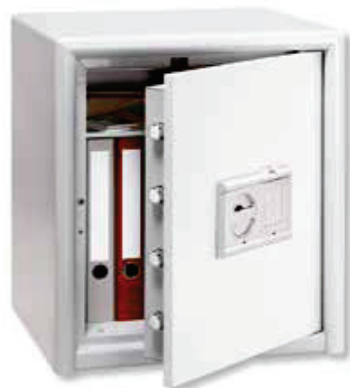
CL 40 E FS