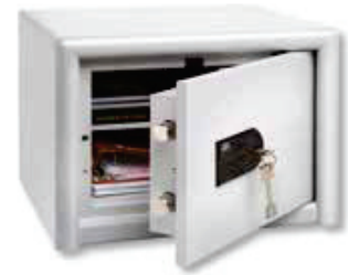
CL 10 S