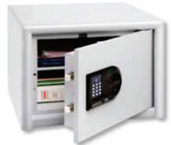
CL 20 E